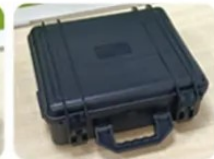
Portable waterproof tank